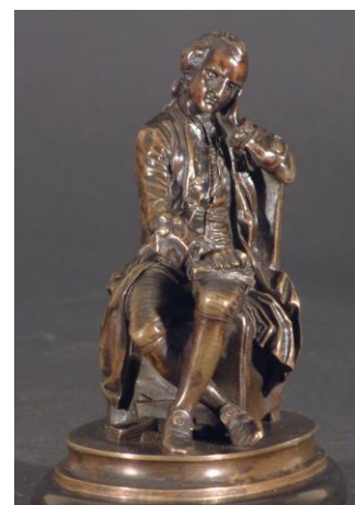
SOLD - bronze poet by Etienne Melingue, 1839, around £1,000 from Garret & Hurst Sculpture

The Tortworth Court Antiques and Fine Art Fair 25 - 27 February 2011