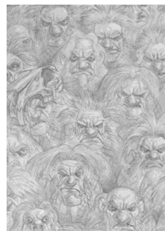
SOLD - 'The Clan' (detail) by Paul Kidby, around £1,000 from Art of the Imagination

P.O. Box 119 Cranbrook Kent TN18 5WB Tel/Fax 01797 252030 E-mail info@adfl.co.uk Web www.adfl.co.uk Reg. no. 04293279 (England & Wales)